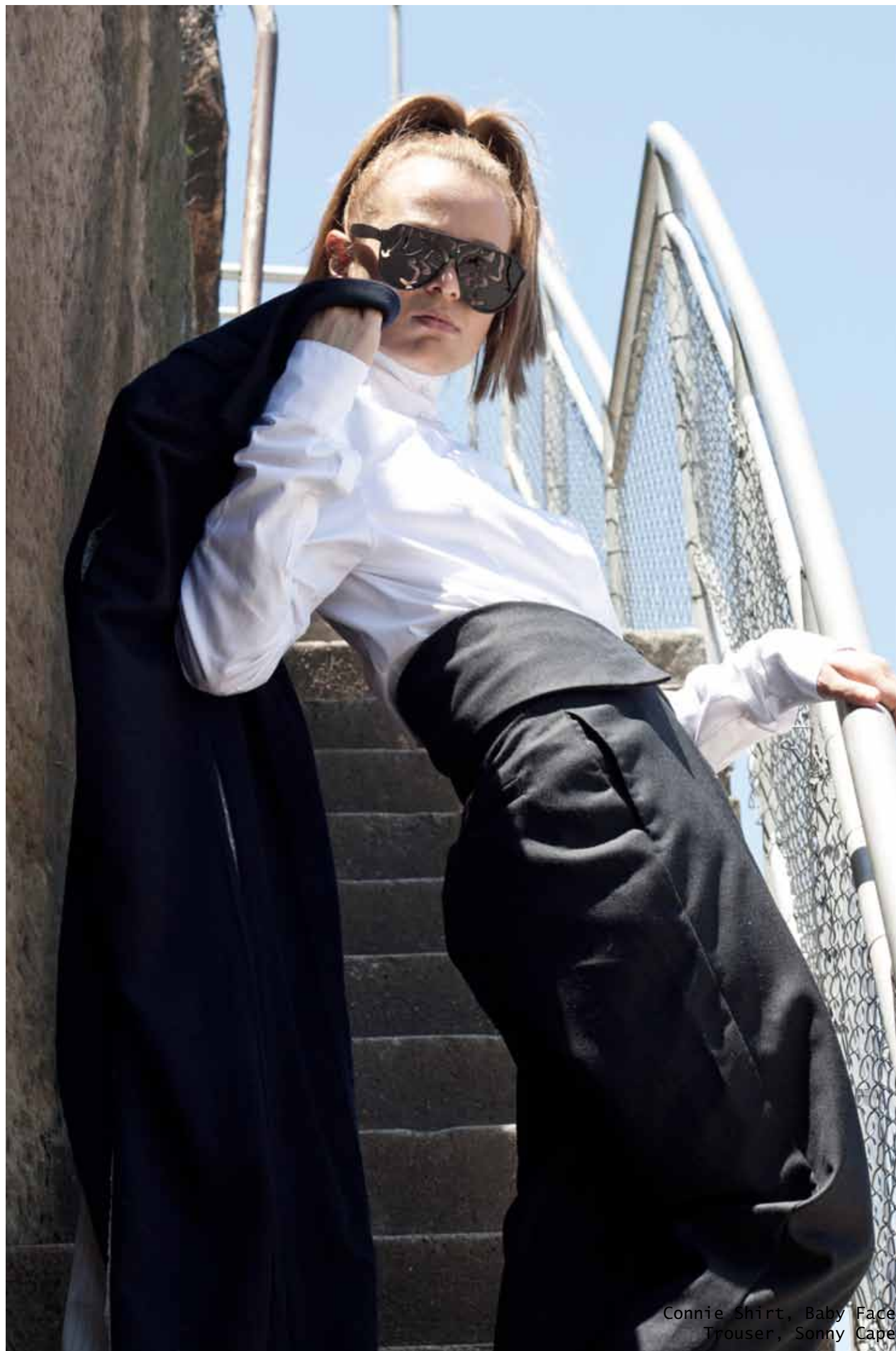
Connie Shirt, Baby Face Trouser, Sonny Cape