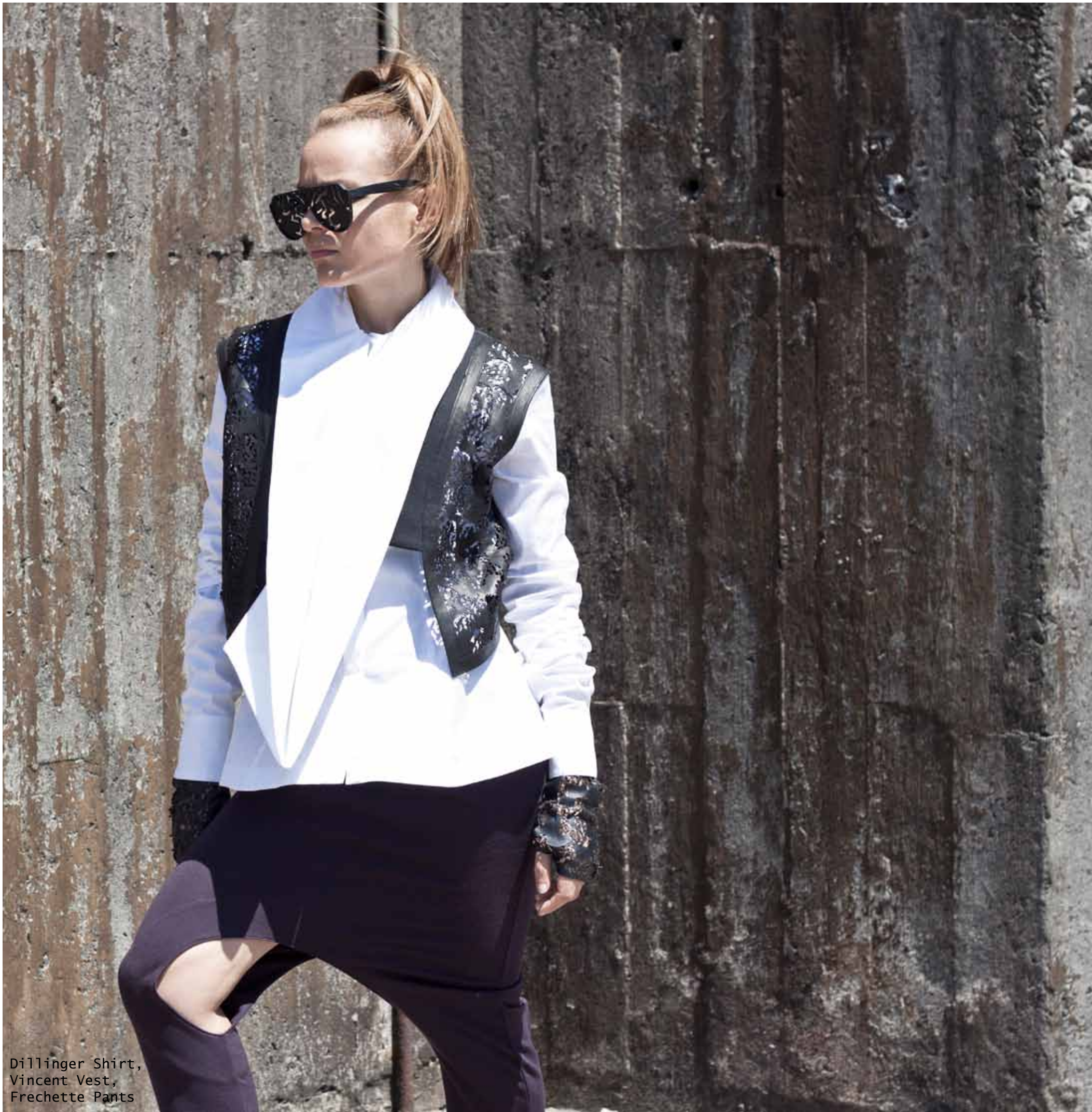
Dillinger Shirt, Vincent Vest, Frechette Pants