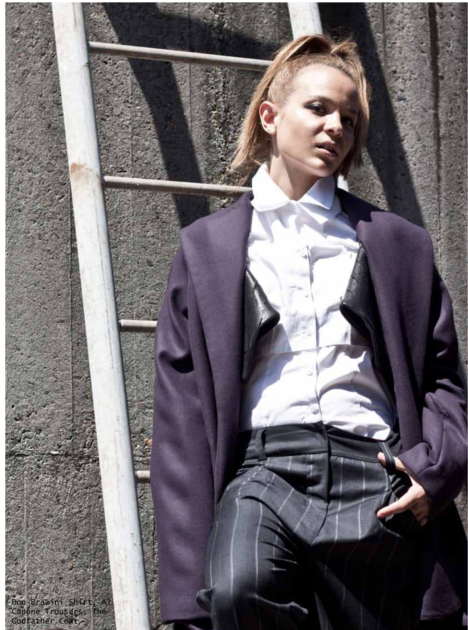
Don Brazini Shirt, Al Capone Trousers, The Godfather Coat