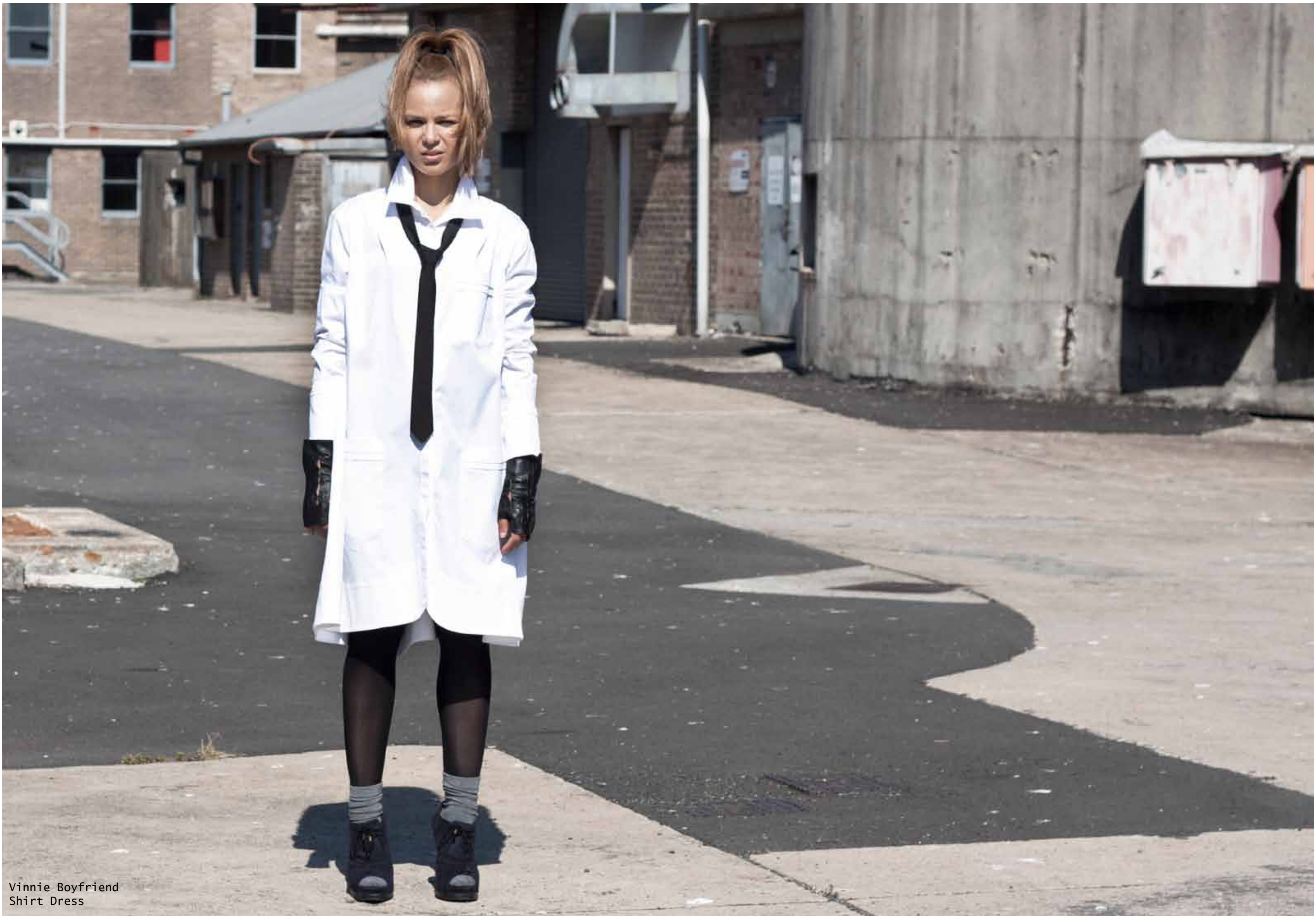
Vinnie Boyfriend Shirt Dress