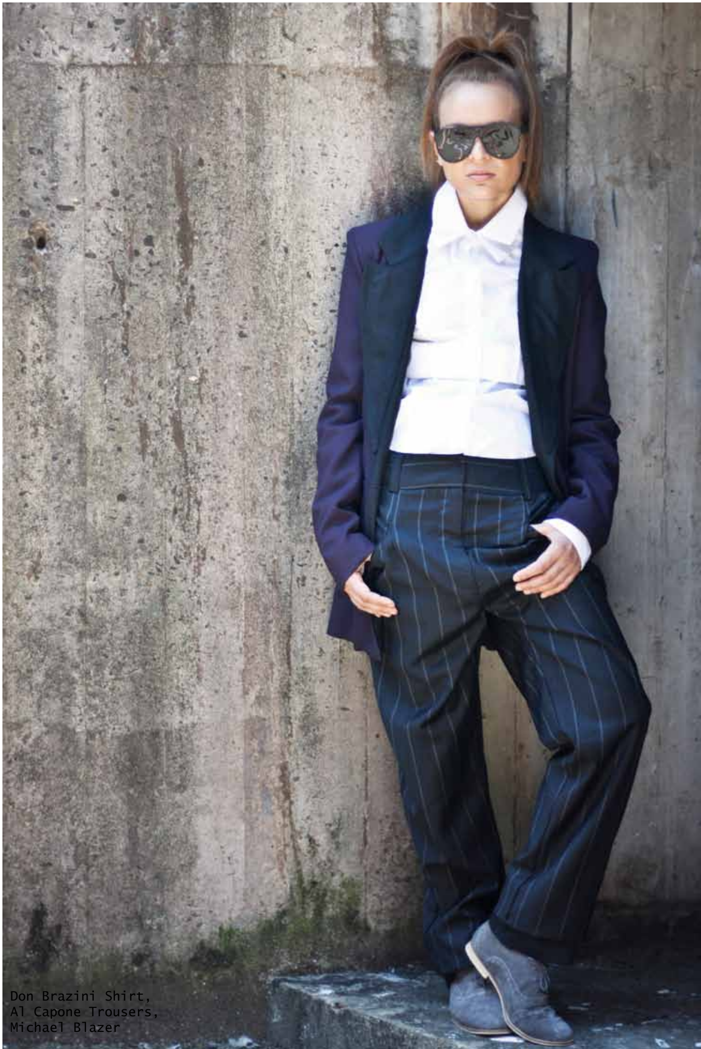
Don Brazini Shirt, Al Capone Trousers, Michael Blazer